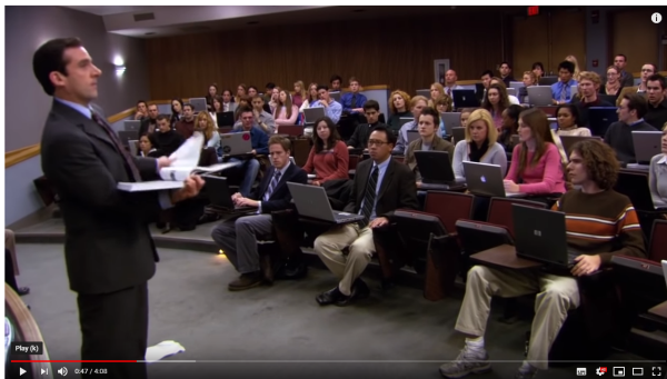
Michael Scott's Business Lecture - The Office US 510,695 views